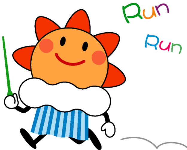
The JMA mascot; Harerun

When you have any difficulties or need help during the course of the seminar, please feel free to contact JMA staff ( tcc@met.kishou.go.jp ).