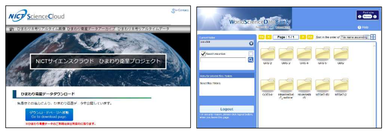
Figure 6 NICT Science Cloud Himawari Satellite Project