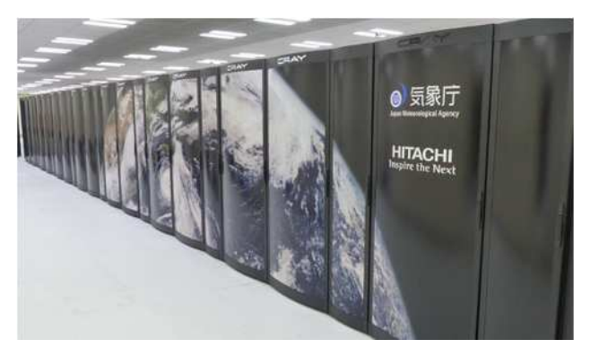
Figure 2 Subsystem of JMA's new super computer set-up